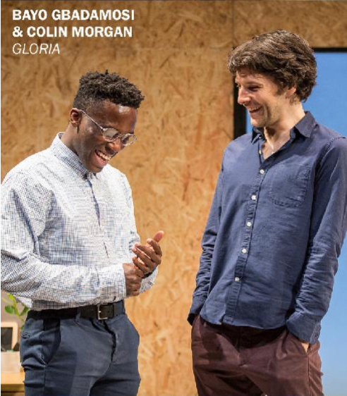
BAYO GBADAMOSI & COLIN MORGAN GLORIA