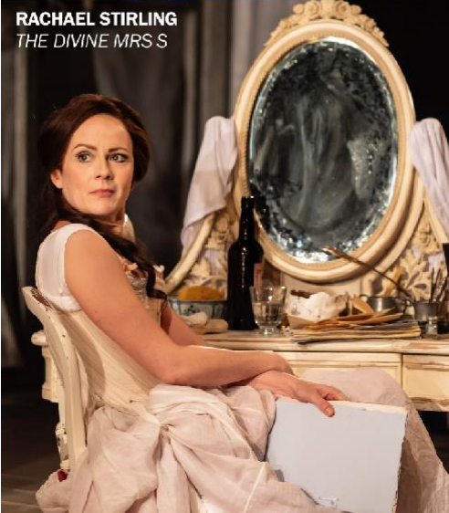
RACHAEL STIRLING THE DIVINE MRS S